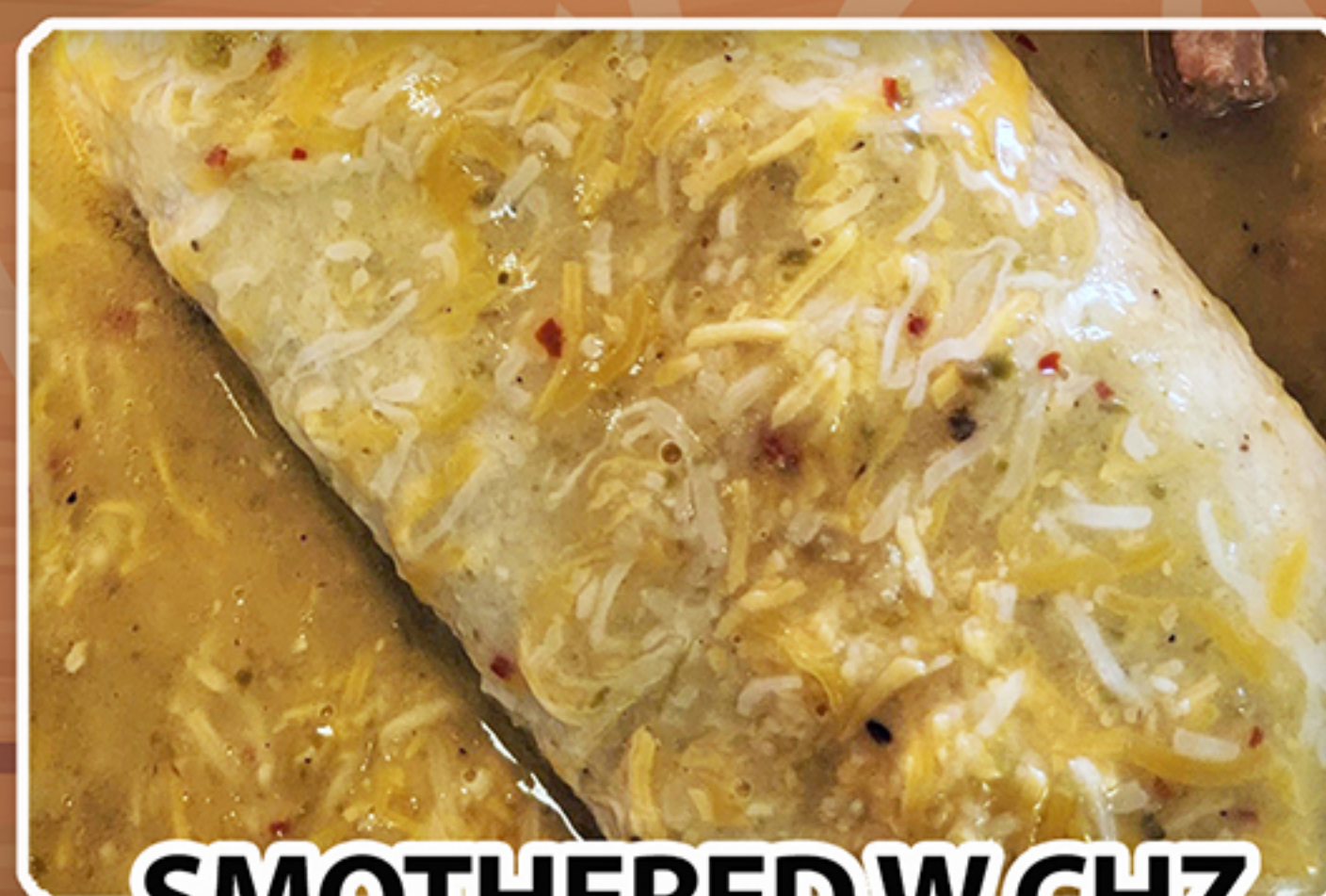
SMOTHERED W CHZ